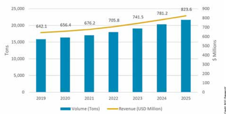
Figure 2. Global market for carbon fiber used in sports equipment, 2019–2025. The market is expected to grow at a compound annual growth rate of 5.7% during this time.<sup>5</sup>

Another place carbon fiber can be found, perhaps surprisingly, is on athletes' feet. (Table 2). A company called Carbitex (Kennewick, Wash.) developed an asymmetrically flexible carbon fiber/ thermoplastic composite material that is flexible in one direction yet rigid in another, mimicking and protecting the