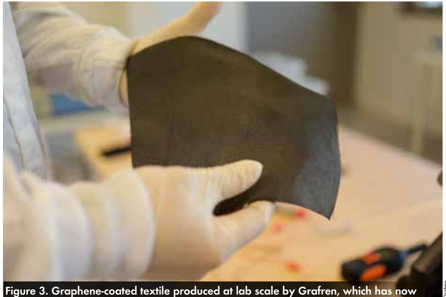
Figure 3. Graphene-coated textile produced at lab scale by Grafren, which has now mastered industrial scale at 200 cm roll-to-roll.

Grafren's water-based process does not use any binders, resulting in